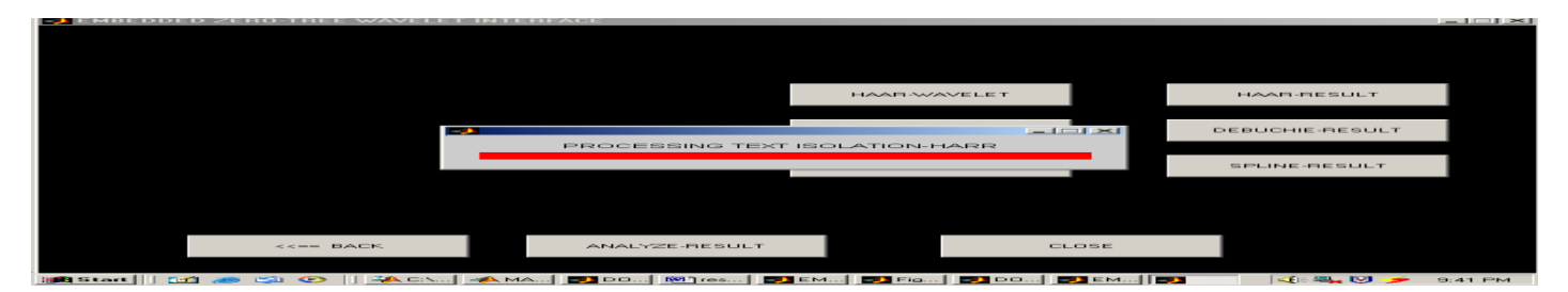
Figure VI.5: Processing video data using Haar wavelet

Documented video data is processed using various wavelets such as Haar wavelet, Debuchie wavelet and Spline wavelet. PROCESSING INPUT DATA USING HAAR WAVELET