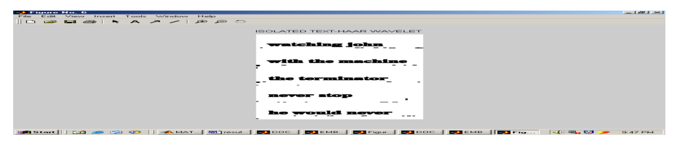
Figure VI.6: text isolation from video file using Haar wavelet

Figure shows the text, which is isolated from documented video data file using Haar wavelet transformation. ERROR COMPARISON PLOT FOR WAVELETS